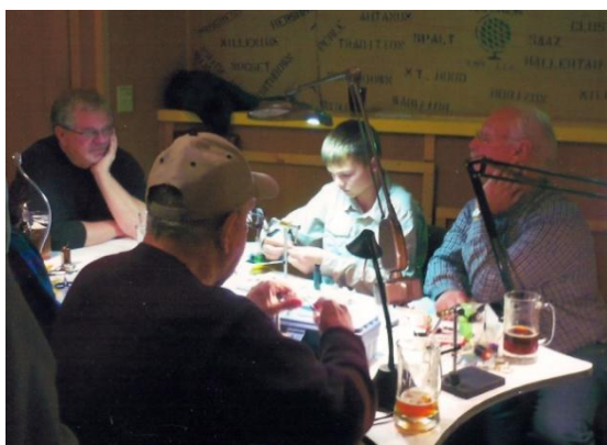
Blaine as featured tier at a Wednesday night session at the Brewery.