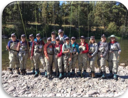
Western Montana program 2018 participants

Casting for Recovery (CfR) provides free support and education retreats for women of all ages and in any stage of breast cancer treatment or recovery, incorporating fly fishing into the program. Headquartered in Bozeman, MT, CfR is in its 23 rd year with 60 retreats across the country.